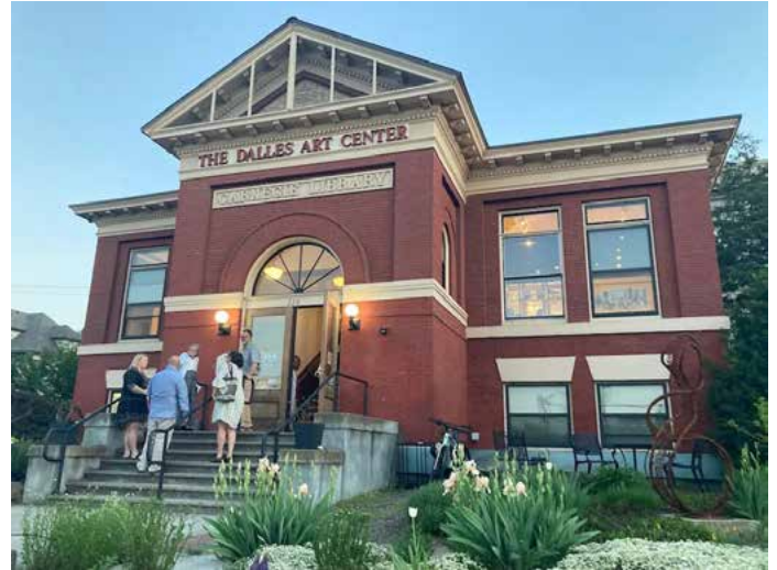
A crowd gathers for an event at The Dalles Art Center.