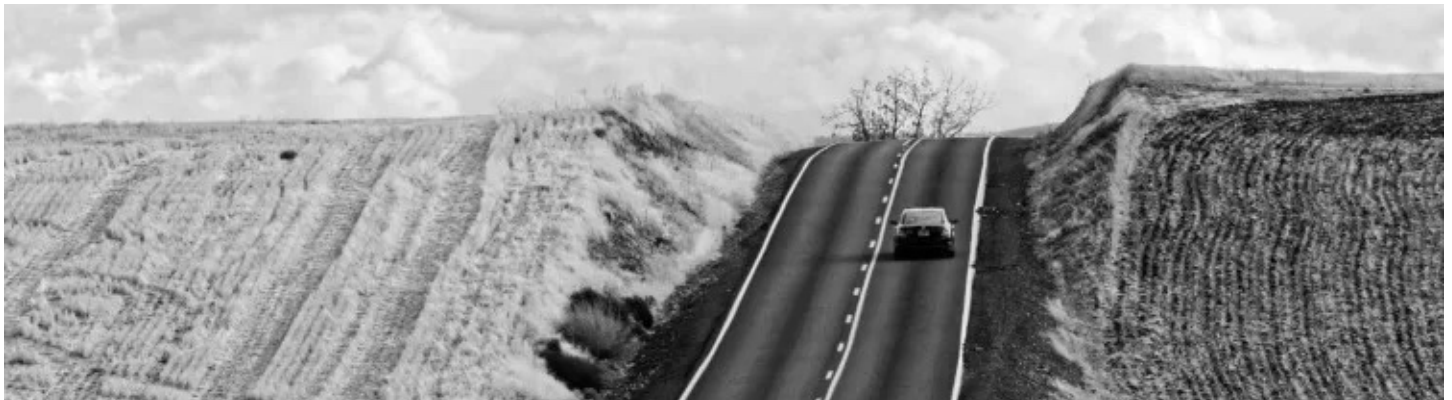
Landscape around Pendleton near Crow's Shadow Institute of the Arts, which was profiled in the Indigenous History & Resilience series.