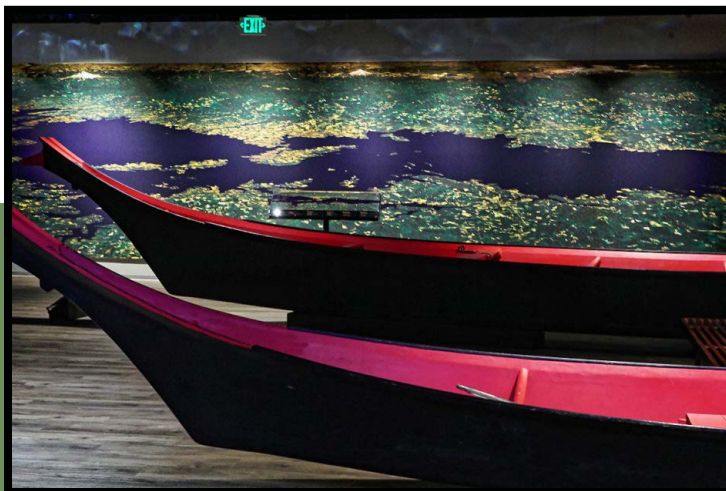
Two canoes in front of a panoramic image of the Willamette Valley. Chachalu Museum and Cultural Center.